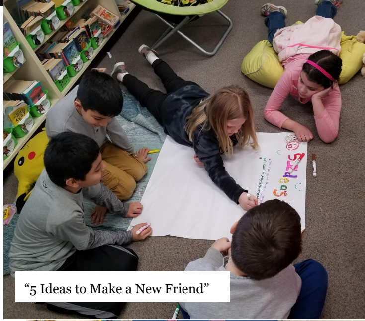
"5 Ideas to Make a New Friend"