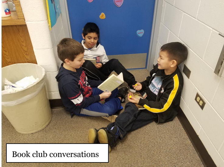
Book club conversations