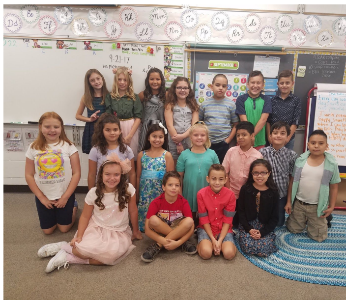
Our good-looking class on picture day!

More Halloween information coming home soon!