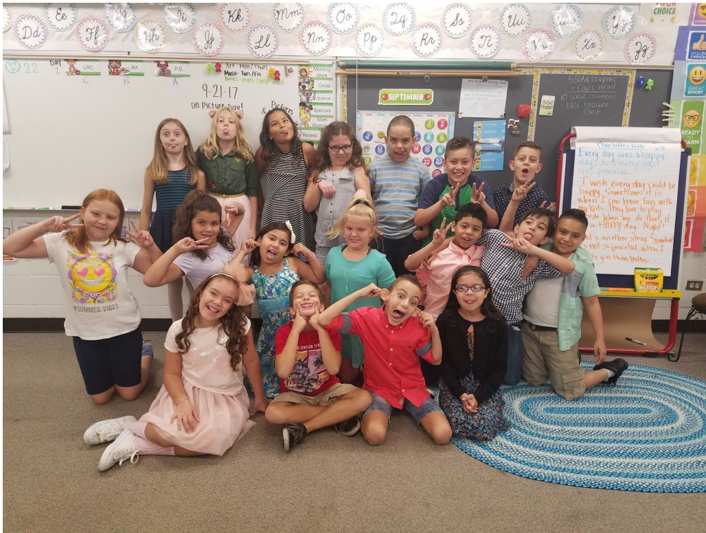
A more realistic picture of our class